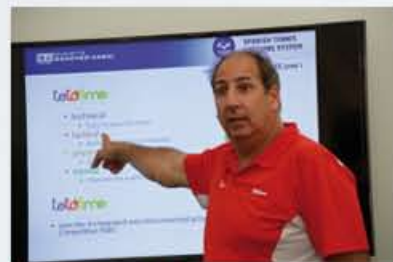
Emilio Sánchez Vicario ICI President